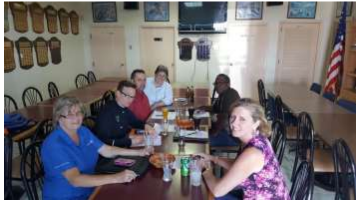
Serving on the ASSE GP Chapter board is both rewarding and fun. Contact one of our officers to learn more.